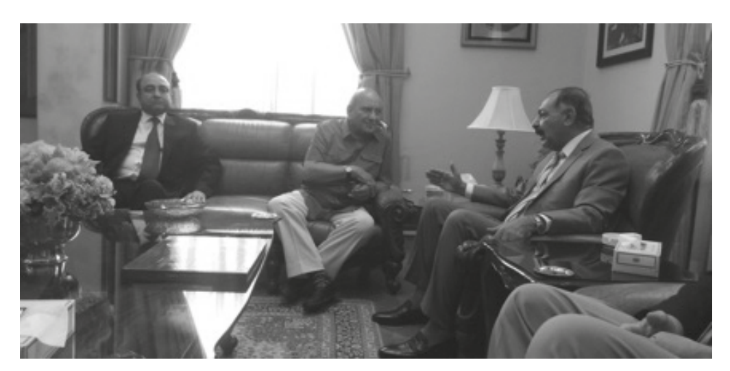
HRCP's mission meets the Governor of Balochistan, Amanullah Khan Yasinzai

The mission briefly discussed the impact of CPEC on Balochistan. The Governor observed that the pace of work on projects related to CPEC would soon gain momentum and that the people of Balochistan – in particular, its youth – would benefit from the ensuing job opportunities. While discussing the issues faced by the agricultural sector, the Governor told the mission that the federal and provincial governments were considering building more small dams in the province to help farmers.