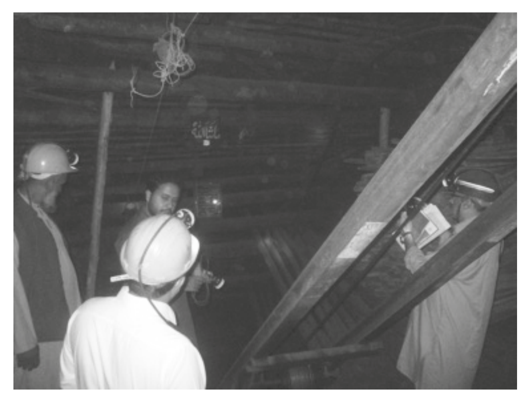
Mission members speak to mine workers at a coal mine in the Sor Range

Most other mines in the province, however, do not have such facilities available for miners. Lack of protective gear, medical facilities, ambulances and hospitals make the work hazardous. Most miners are not local and come from Khyber-Pakhtunkhwa to find work. As a result, they have no local support base. They work on a contract basis and lack job security. Although miners are supposed to work no longer than eight-hour shifts, they are not stopped from working 10–12 hours a day. Working conditions are grim: little attention is given to health or safety, nor is clean drinking water and quality food provided.