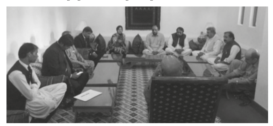
HRCP's mission meets members of civil society in Quetta

Civil society organizations (CSOs) that met the mission said there was an increase in pressure not to work on human rights issues in the province. Intelligence personnel visit CSO offices regularly and demand to see documents related to their staff and the projects they are working on – such visits have become more frequent in recent years. Meanwhile, the process of registration for new CSOs has been made very complicated to the extent of discouraging them from registering at all.