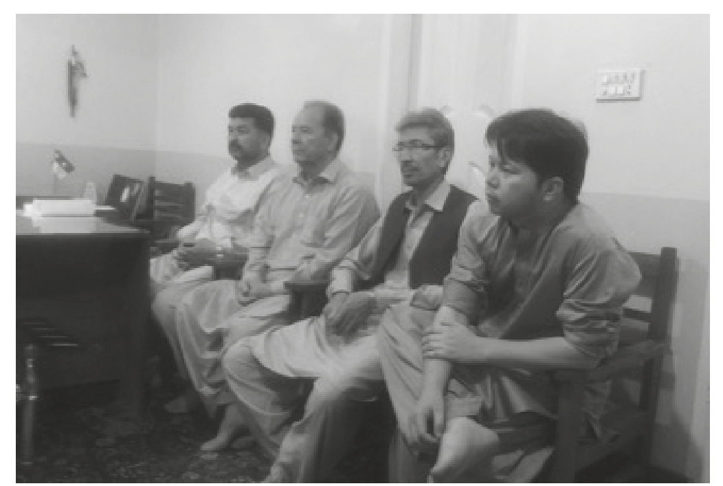
Members of the Shia Hazara community express their concerns to the mission

A primary concern expressed at this meeting was the lack of follow-up with, and support for, the families of victims of sectarian or terrorist attacks against the community. While victims' families are assured they will receive compensation as announced by the government, they say this is sporadic at best. The Hazara community has constantly urged the state, the provincial government and civil society organizations to support victims' families. The HDP demands that a commission be set up to focus on this issue.