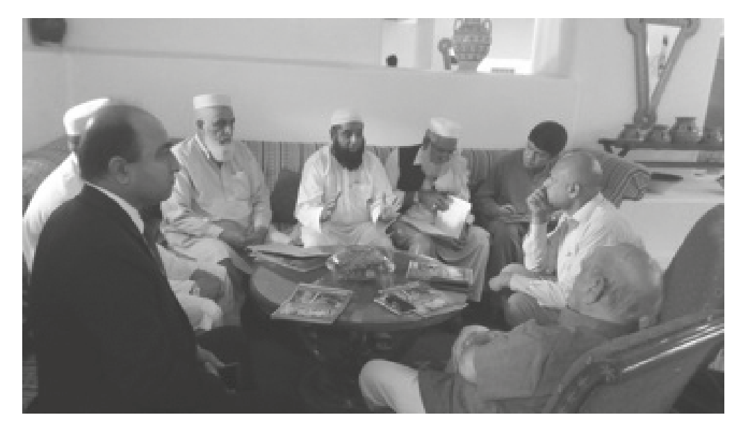
The mission meeting labour union members

The labour union representatives that met HRCP's mission said that 62 unions had been banned. They believe this infringes on their fundamental right to association. In several areas, such as the mines in Saindak in Chaghi District, workers are not allowed to form labour unions. Labour leaders believe that unions are disallowed, or at the very least discouraged, in areas where foreigners are involved. They also claim that any labour demonstrations they might try and organize to highlight their concerns are actively disrupted by the FC or other LEAs.