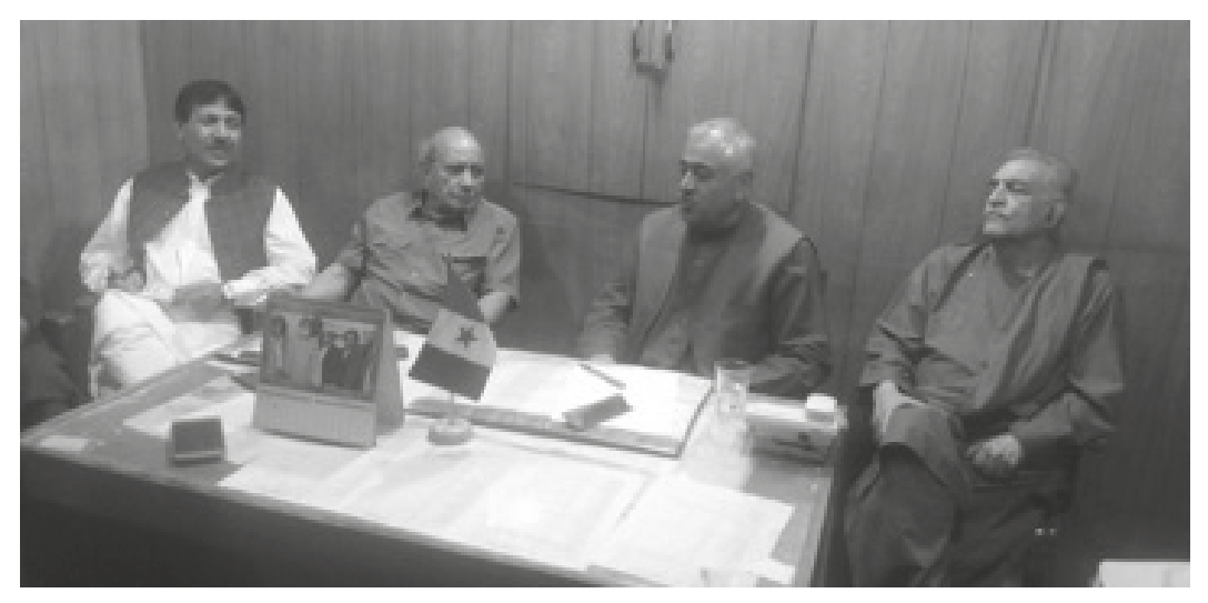
HRCP's mission met representatives of the PkMAP

The HRCP mission met a number of political party representatives in Quetta and Makran, including the Awami National Party (ANP), Balochistan National Party (Mengal) (BNP-M), Hazara Democratic Party (HDP), National Party (NP), Pakhtunkhwa Milli Awami Party (PkMAP), Pakistan National Party (Awami), Pakistan People's Party (PPP) and Pakistan Muslim League (Nawaz) (PML-N). The consensus appeared to be that Balochistan's political climate had deteriorated. Party representatives felt that the 2018 general elections were marked by fear and rampant horse-trading. Almost all the political parties HRCP consulted had reservations concerning the democratic credentials of the current provincial government, including allegations of the security apparatus being used against democratic forces and the elections having been manipulated in favour of candidates with 'pro-establishment' credentials.