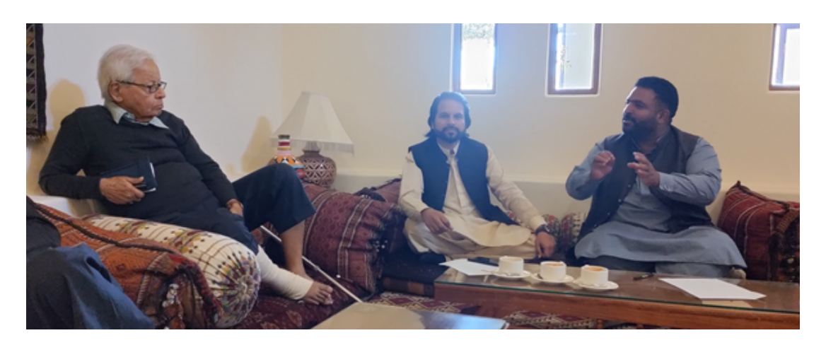
Members of the Christian community in Quetta said they were seen as 'outsiders' in the province

of the party leadership, with no input from the minority community itself, they are answerable solely to senior party members, making it impossible for their community to hold them accountable since they do not rely on them for political support or votes. One of the members highlighted that all mainstream political parties did not even bother to pay lip service to minority issues in their manifestos published prior to the 2018 election. They also spoke of the wanton land grabbing of real estate owned by the Christian community, with a missionary hospital in Quetta recently having been taken over by a local political leader and well-off minority members from other provinces being brought in to run it. One individual also spoke of jailed Christians being promised clemency if they converted to Islam, highlighting a larger endemic issue around coerced conversions in the province.