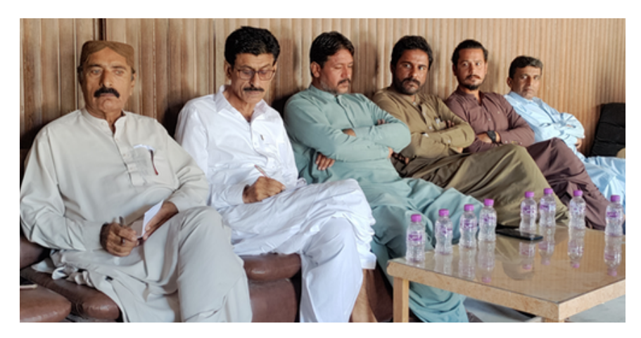
Fisherfolk rights activists in Gwadar said that illegal trawlers had depleted the area's seafood reserves, affecting local livelihoods

They said that the recently inaugurated Eastbay Expressway (a USD 168 million CPEC project), which connects the main port to the Makran Coastal Highway, had cut off their access to the Arabian Sea, thereby affecting the livelihoods of thousands of local fisherfolk. In a city where an estimated two thirds of the population relies on fishing for a livelihood, this is cause for concern.