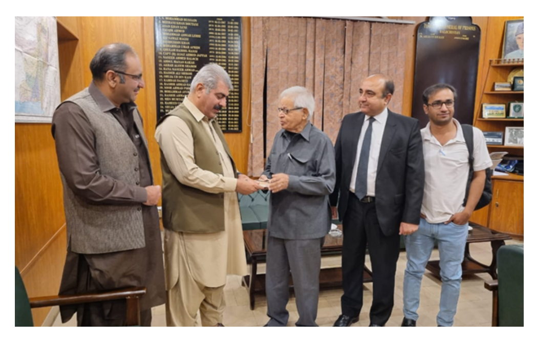
The inspector general of prisons in Quetta said that prisons rely on donations to meet their need for medical supplies

At a meeting with the inspector general of prisons in Quetta, the mission was told that inadequate budgetary allocations meant the provincial prisons department would not be able to expand jail capacity to meet any future increase in the inmate population. Inflation has also increased the cost of meals per inmate from PKR 250 to PKR 270, he explained.