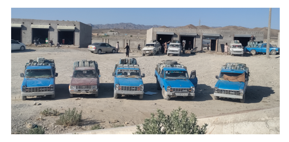
In Makran, pickups wait to cross the border to bring back smuggled petrol from Iran—a source of livelihood for many

These dynamics have created a rent-seeking oligarchy of state institutions that has concentrated economic and political power, making the provincial economy highly exclusionary.