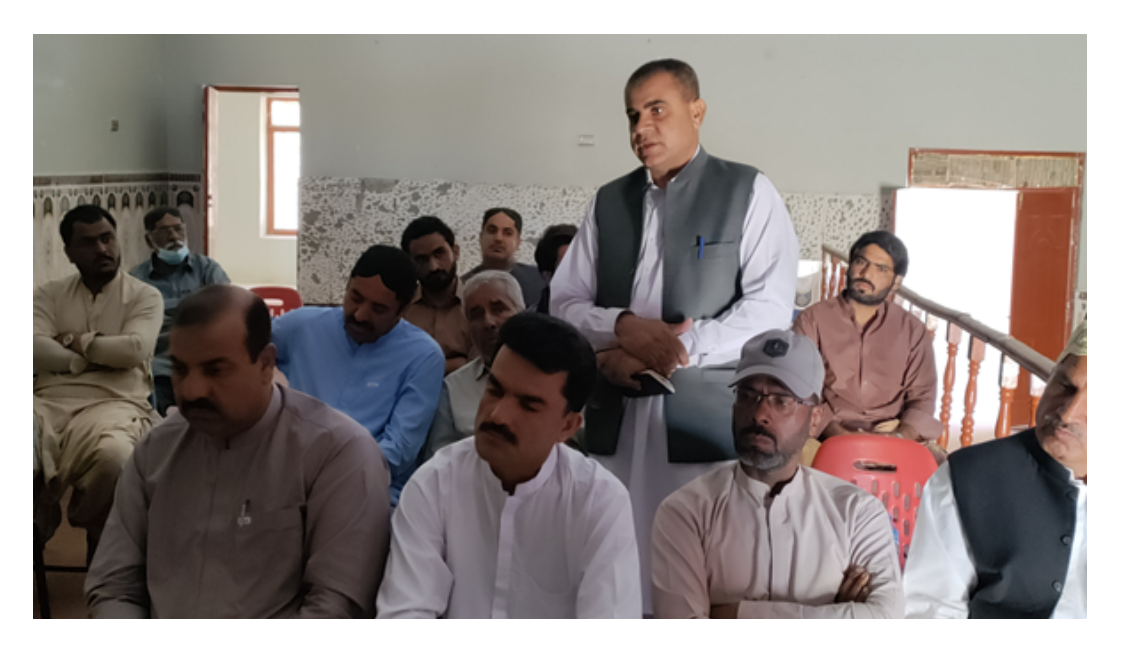
Residents of Panjgur expressed frustration at the dearth of viable economic opportunities in the area

Although the Mand-Pishin border crossing in Kech district has been operational for some time, recent border fencing has allowed authorities such as the FC to monopolise trade by issuing a 'token' system that grants preferential access to buyers, as corroborated by members of civil society in Panjgur.