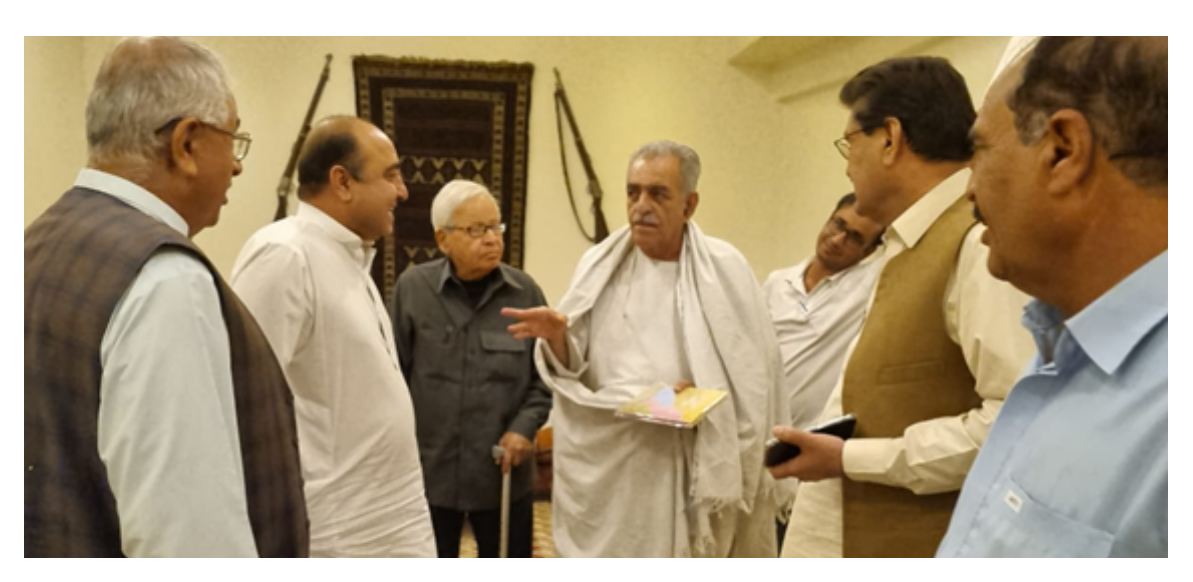
Members of the mission speak to the PKMAP leadership in Quetta

A particularly serious allegation made by the party was that the state continued to stoke tribal disputes as a tactic to preserve provincial disunity. One solution proposed to the mission was to hold a roundtable that would bring together all stakeholders of the province—including all political parties, the bureaucracy, the media, the legal community and the security establishment—to find a way forward.