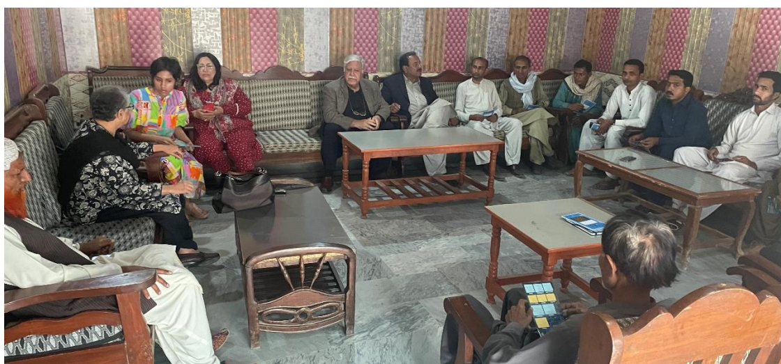
Meeting with Hindu residents of the Meghwar Mohalla colony, Sarhad, Ghotki

Sindh has the unique distinction of hosting the highest population of Hindus in the country in its rural areas, followed by the Christian, Sikh, Parsi, Kalash and Buddhist communities. The mission was able to meet representatives from the Hindu and Christian communities, lawyers, teachers, students and political workers throughout the mission. On one such occasion, the mission met with the Hindu residents of Meghwar Mohalla, a colony comprising at least 50 houses and over 500 Hindu residents, in the town of Sarhad, district Ghotki. From this meeting, the mission observed that despite claims of social cohesion, religious minorities in northern Sindh felt vulnerable to violations of their rights due to institutionalised discrimination, arbitrary blasphemy accusations and faith-based conversions.