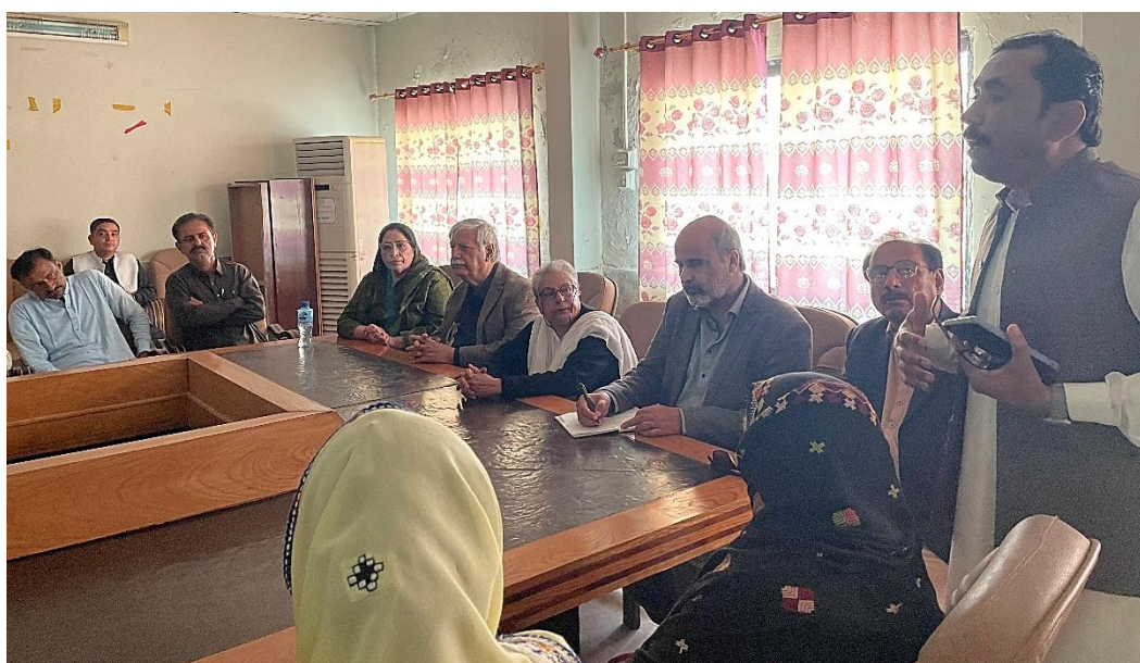
Meeting with civil society representatives at the District Council Office in Kandkoth

One lawyer in Kandhkot related his inability to lodge first information reports (FIRs) and initiate legal proceedings for eight such incidents of honour killings. The mission further noted that, in many cases of honour killings, efforts to file applications under provisions 22-A and 22-B of the Code of Criminal Procedure (CrPC) to seek case registration and transfer of investigative powers remained futile as well.