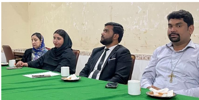
A Baptist church pastor in Jacobabad expressed concern regarding women voters' safety