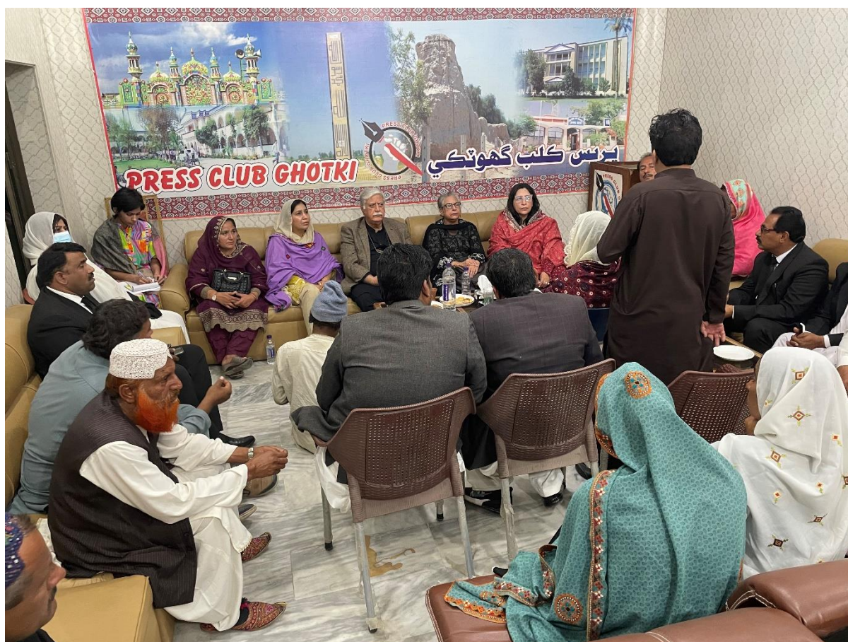
Meeting with the community at Ghotki Press Club

There is brewing resentment against the lack of livelihood opportunities and civic amenities for local residents, particularly in Ghotki and Kandhkot which are credited with the largest oil and gas fields, power projects and fertiliser plants in the country. Over a 100 gas deposits – first discovered by the Mari Petroleum Company in 1956 – exist in Ghotki. A local journalist cited at least five sugar mills and four power plants in Ghotki, noting the dichotomy since residents face electricity shortages themselves. The president of Ghotki's district bar association alleged that the average daily wages for workers ranged between PKR 500-600. Kashmore, a right bank district, is considered the least developed district in Sindh despite the presence of Pakistan's largest public-sector thermal power plant on its land. Residents lament the lack of irrigation water, despite the presence of mega-irrigation structures. Kashmore is additionally located on the proposed China Pakistan Economic Corridor (CPEC) route, touching Dera Bugti of Balochistan in the north. Many expressed outrage at the stone crushing plants at Dera Bugti and Kashmore, which generates lofty revenues for CPEC without providing the benefit of adequate employment to local people.