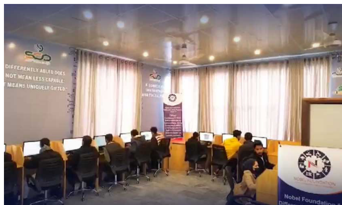
AJK's first dedicated freelancing hub for persons living with disabilities was established.

In January, the Special Communications Organization established AJK's first dedicated freelancing hub for persons living with disabilities in Muzaffarabad. This initiative aims to support their socioeconomic inclusion by providing specialised IT training and digital work opportunities.