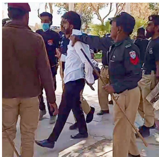
The Jamshoro police baton-charged students and fired teargas shells to disperse a protest against the proposed Cholistan canal.the proposed construction of six canals on the Indus River system.

Students baton charged. In March, the Jamshoro police baton-charged students and fired teargas shells to disperse a protest against the proposed Cholistan canal and other water channels intended to irrigate land in Punjab using Indus River water. A case was registered against the protesting students. HRCP expressed concern over the criminal case filed against nearly 100 students in Jamshoro for participating in the protest.