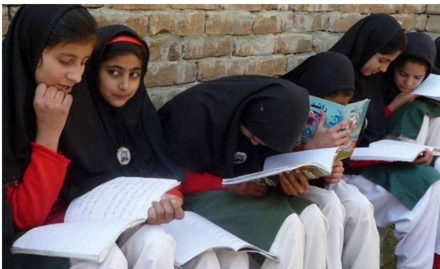
Upper Chitral district recorded the lowest proportion, with only 10 percent out of school.

In November, news reports highlighted stark neglect in Upper Kohistan, where 60 percent of primary and middle schools for girls remained shuttered due to teacher scarcity and absenteeism.