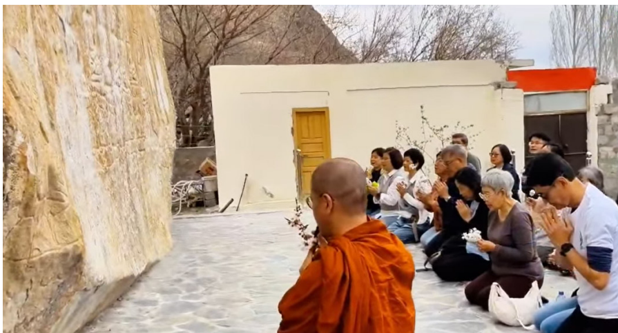
Malaysian Buddhist delegation visited sacred heritage sites, including the historic Manthal Buddha Rock near Skardu.

In 2025, Gilgit-Baltistan experienced heightened sectarian tensions and religious unrest, particularly following attacks on prominent religious figures and the detention of clerics. Despite these challenges, the region's potential for religious tourism was highlighted in April 2025 when a Malaysian Buddhist delegation visited sacred heritage sites, including the historic Manthal Buddha Rock near Skardu, and performed rituals.