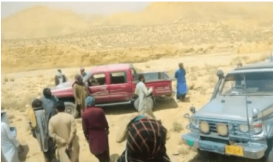
A video went viral showing a group of men leading a couple to a deserted area and shooting them from behind in the name of honour in the Dagari area of Quetta.

The third case emerged when a video went viral on 19 July, showing a group of men leading a couple to a deserted area and shooting them from behind in the name of honour in the Dagari area of Quetta district. The incident gained national and international media attention, prompting strong criticism of the government from rights activists and politicians. The government responded by arresting one person.