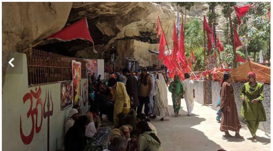
In 2025, a record number of Hindu pilgrims attended the annual Hinglaj Mata festival in Lasbela.