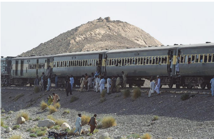
Baloch Liberation Army (BLA) militants hijacked the the Jaffar Express in March.

In March, a rare and deadly train hijacking occurred when Baloch Liberation Army (BLA) militants executed a highly coordinated attack. Armed men detonated explosives on the tracks near the Mashkaf Tunnel to stop the Jaffar Express on 11 March, taking more than 400 passengers hostage, including numerous security personnel, resulting in a 36-hour battle between militants and security forces. A major clearance operation by the armed forces rescued the hostages the next day. According to official sources, 33 militants and 26 passengers were killed.