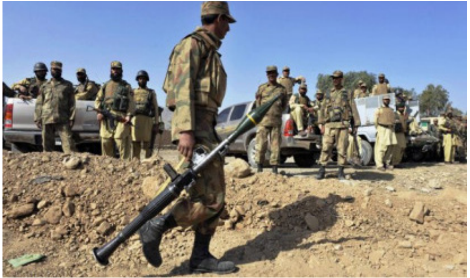
The province accounted for the overwhelming share of over 1,500 terror-related incidents nationwide.

The most alarming trend in 2025 was the surge in militancy. The province accounted for the overwhelming share of over 1,500 terror-related incidents nationwide, with the southern provincial districts bearing the brunt. Casualties among law enforcement personnel rose sharply and violence claimed hundreds of civilian lives, including women and children. Thousands of intelligence-based operations underscored the relentless nature of the security crisis but also raised concerns about heavy-handed counter-terrorism tactics and