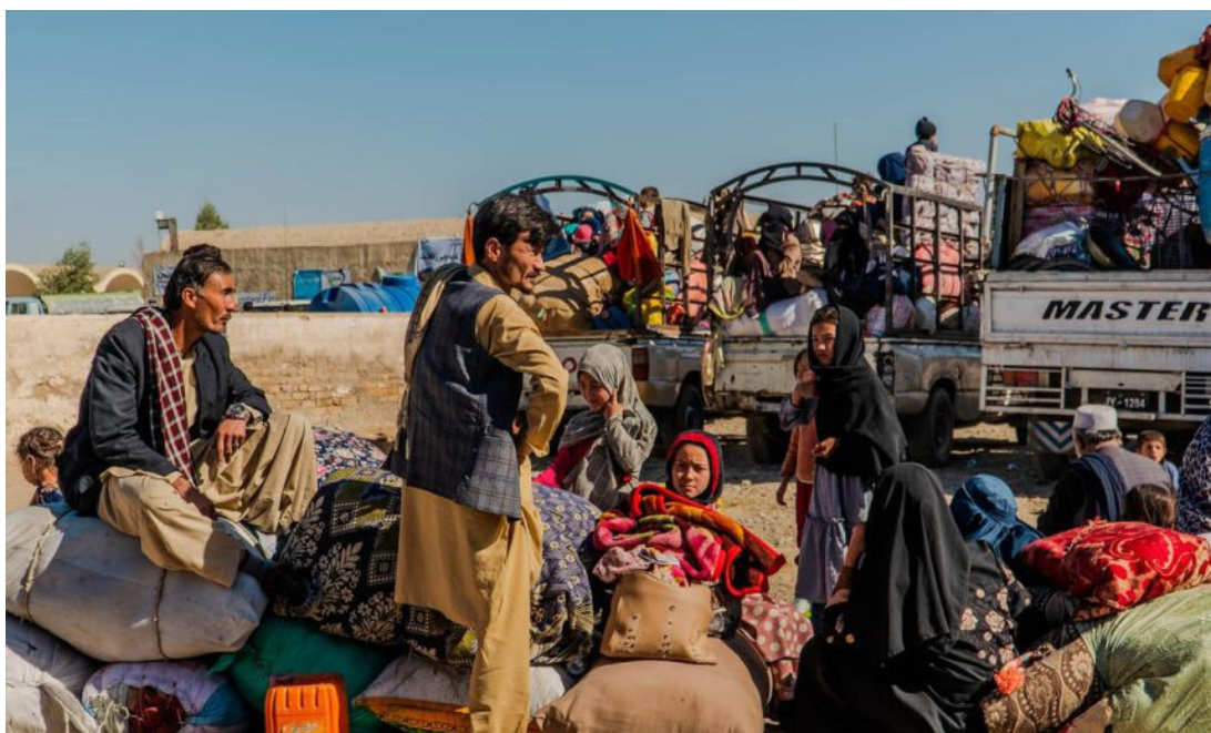
The state's controversial and inhumane deportation of Afghan refugees continued forcefully.

Overall, in 2025, UNHCR recorded the return of more than 1.1 million people from Pakistan to Afghanistan, of whom over 154,000 were deported. As of 31 December, the UN body reported a little over one million registered Afghan refugees still residing in Pakistan, with 2.4 percent (24,179 individuals) said to be in Islamabad.