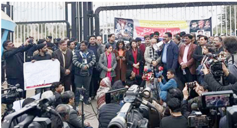
The amendments to PECA 2016 triggered widespread condemnation from rights groups, media organisations, and political activists.

In January, the National Assembly amended PECA, increasing the severity of its penalties for journalists and online content creators. This action triggered widespread condemnation from rights groups, media organisations, and political activists, who cautioned that the law, particularly Section 26A concerning ‘fake or false news,’ lacked clear safeguards and narrowly defined terms. Critics warned that this ambiguity risked weaponising the law to suppress