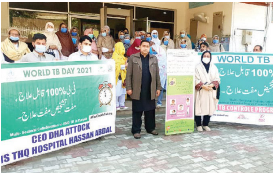
Pakistan recorded an estimated 670,000 tuberculosis cases and 47,000 deaths in 2024.

Pakistan recorded an estimated 670,000 tuberculosis cases and 47,000 deaths in 2024, placing it among the top five countries driving the epidemic and accounting for 6.3 percent of the global tuberculosis burden, according to a World Health Organization report in November. The report stated that Pakistan continued to face one of the largest gaps between estimated cases and actual reporting and diagnosis, as millions remained untested due to poverty, stigma, weak surveillance, and limited access to testing. The preventable and treatable disease continues to be one of the deadliest infectious killers in the country, with poverty, undernutrition, overcrowding, and diabetes fuelling transmission, especially in more susceptible urban informal settlements, rural areas, and among marginalised communities.