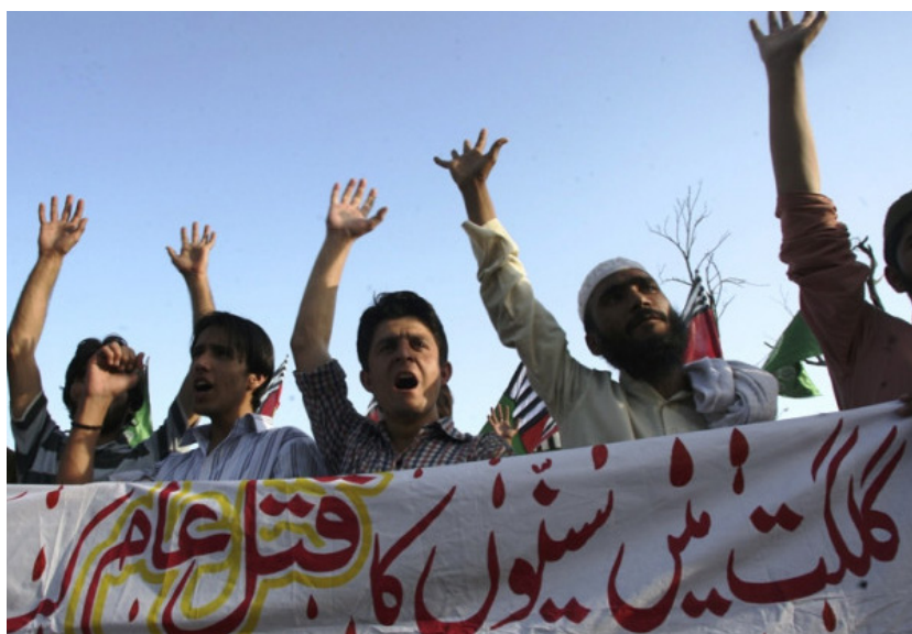
Sectarian tensions in Gilgit-Baltistan persisted due to a complex web of political and social factors.