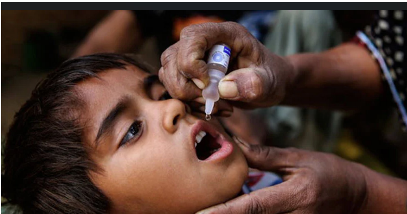
Of the 31 polio cases reported in Pakistan in 2025, nine were from Sindh.

Polio. Of the 31 polio cases reported in Pakistan in 2025, nine were from Sindh. Official data indicates that parents refused polio vaccinations for 41,875 children during home visits in Karachi. In contrast, only 1,124 refusals were reported in other districts of Sindh.