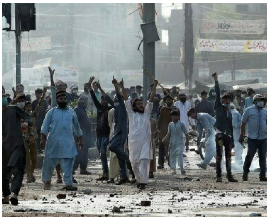
In October, supporters of the TLP marched from Lahore toward Islamabad to protest in solidarity with Palestinians in Gaza outside the US embassy.

TLP protest. In October, supporters of the TLP, a far-right religious-political party, marched from Lahore toward Islamabad to protest in solidarity with Palestinians in Gaza outside the US embassy. Despite a ban on public gatherings under Section 144, they set up camps along the Grand Trunk Road in Muridke. The authorities dug trenches in the road ahead to block their march. On 13 October, the Punjab Police and Rangers launched a large-scale ‘cordon-and-search operation’ involving over 10,000 law enforcement personnel in a pre-dawn raid, leading to pitched clashes. TLP-affiliated social media accounts claimed that around 500 TLP supporters were killed by law enforcement agencies. However, Punjab’s information minister stated that three civilian passersby were killed, while 48 civilians and 110 police officers were injured.