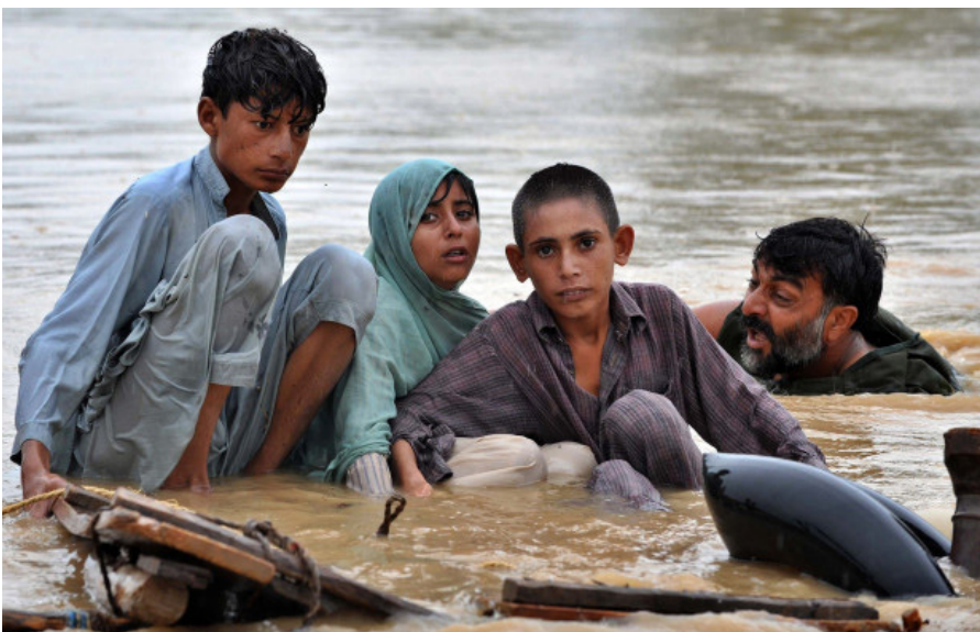
Calamitous rains and floods claimed at least 631 lives in the province during the year.

In August, the chief minister announced a compensation package granting PKR 2 million each to families of the deceased and PKR 500,000 to the injured. Owners of destroyed houses were allocated PKR 1 million each, while partially damaged homes were to receive PKR 300,000. Shopkeepers were compensated with PKR 500,000 for ruined shops and PKR 100,000 for cleanup where floodwaters entered. By August, PKR 654 million had been disbursed digitally to families of 350 deceased individuals, and PKR 6.5 billion was released to the Relief Department to support recovery efforts.