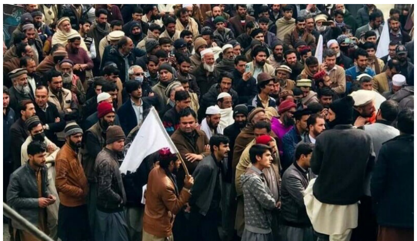
The province saw protests against electricity outages, on wage-related unrest across the academic and health sectors and student mobilisation.

Other protests throughout the year included those by local government representatives over the denial of development allocations and administrative powers; against electricity