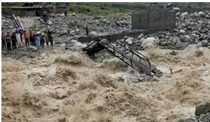
Flash floods between June and August had resulted in 41 deaths, 52 injuries, and damage to at least 1,253 homes.

GLOFs and flash floods. By 12 September 2025, devastating GLOFs and flash floods between June and August had resulted in 41 deaths, 52 injuries, and damage to at least 1,253 homes. The floods also destroyed over 100 bridges and nearly 450 kilometres of roads, severely disrupting relief efforts. The Gilgit-Baltistan Disaster Management Authority set up 11 relief camps, which sheltered 3,140 people, while efforts focused on clearing roads and providing relief to the affected population.