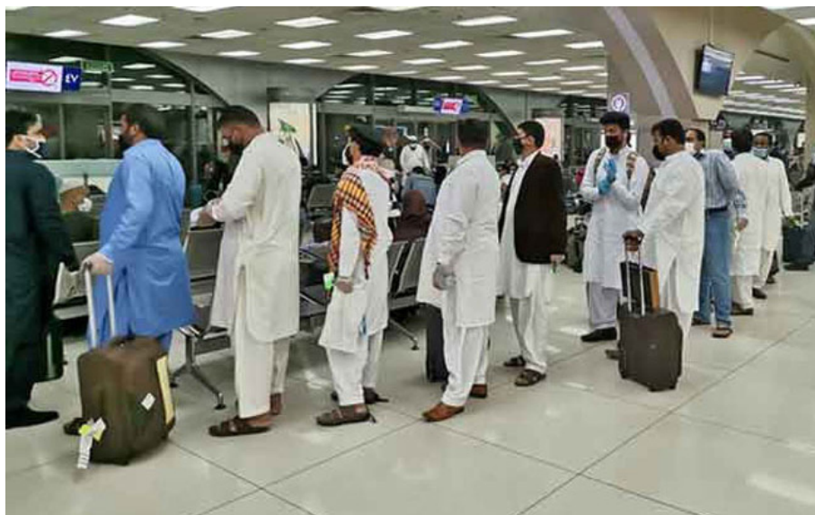
A total of 66,000 passengers were offloaded at various airports in the country.