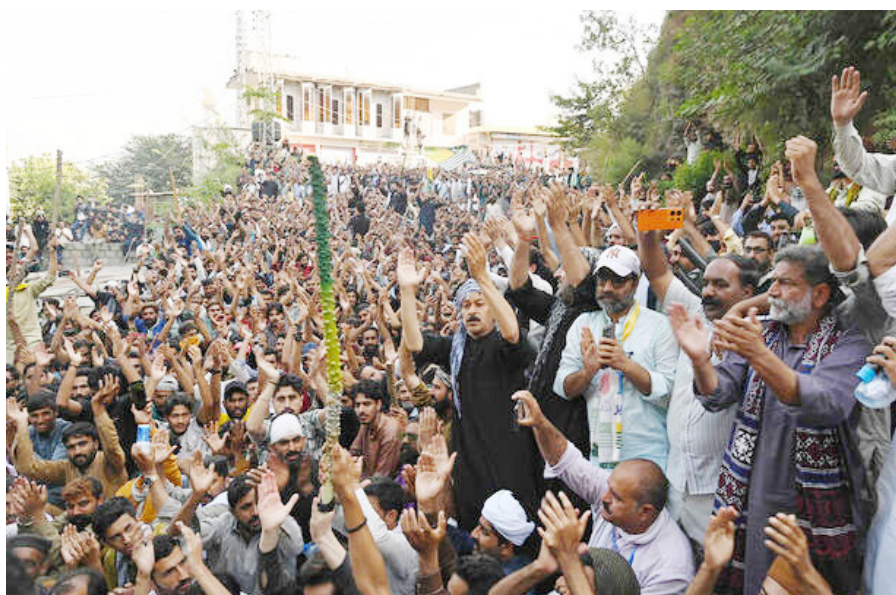
The Joint Awami Action Committee organised a region-wide lockdown and wheel-jam strike that paralysed major districts.

The most significant development of the year occurred in late September and early October when traders, students, lawyers, transporters, and other groups—under the banner of the Joint Awami Action Committee (JAAC)—organised a region-wide lockdown and wheel-jam strike that paralysed major districts. Demanding governance reforms, this marked the third such mobilisation in the last two years. The protests resulted in at least nine deaths, including six civilians and three police personnel, and over 200 injuries. Communication blackouts during this period further restricted civil liberties.