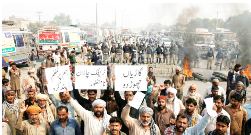
Transport services across Punjab were halted for several days due to a strike by transporters protesting the Motor Vehicle Ordinance 2025.

In December, transport services across Punjab were halted for several days due to a strike by transporters protesting the Motor Vehicle Ordinance 2025, specifically the heavy fines and increased FIRs against drivers. This strike disrupted public travel, goods movement, and commercial supply chains. The strike was called off on 7 December after talks with the provincial government.