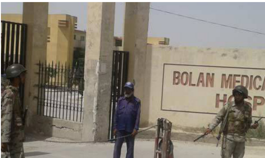
Bolan Medical College reopened in May after a six-month closure resulting from clashes between two student organisations.

Bolan Medical College reopened in May after a six-month closure resulting from clashes between two student organisations in November 2024. The administration also announced a new hostel allotment system.