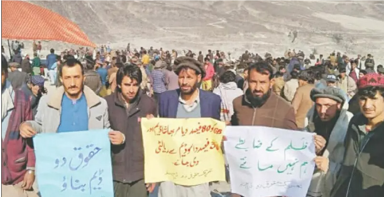
Flash floods between June and August resulted in 41 deaths, 52 injuries, and damage to at least 1,253 homes.

Vulnerable groups faced persistent rights challenges. Women continued to experience gender-based violence, including 14 reported 'honour' killings. They confronted limited legal protections and barriers to justice due to the absence of family courts and shelter services. Children faced serious protection risks, such as a polio outbreak affecting a 23-month-old child, cases of sexual abuse, and alarming reports of the trafficking of 70–80 underage girls. Weak and under-resourced child protection institutions compounded these vulnerabilities. Labour protections remained weak, with informal employment, low wages, and suppressed union activity prevalent across key sectors.