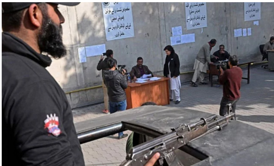
A comprehensive surrender policy for dacoits in the katcha areas encouraged gangs to lay down their arms.

Earlier, in September 2024, the Sindh Assembly passed the Sindh Control of Narcotic Substances Act, which repealed the federal Control of Narcotic Substances Act 1997 to the extent of the province.