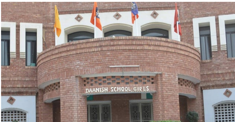
The construction on AJK's first Daanish School in Bhimber began in January.

In 2025, AJK residents remained without access to the federally supported Sehat Card programme, which had previously provided subsidised treatment to millions. The programme was suspended in AJK and neighbouring regions after the federal government failed to clear outstanding dues. Since March 2024, this suspension has affected over 10 million residents of AJK and Gilgit-Baltistan.