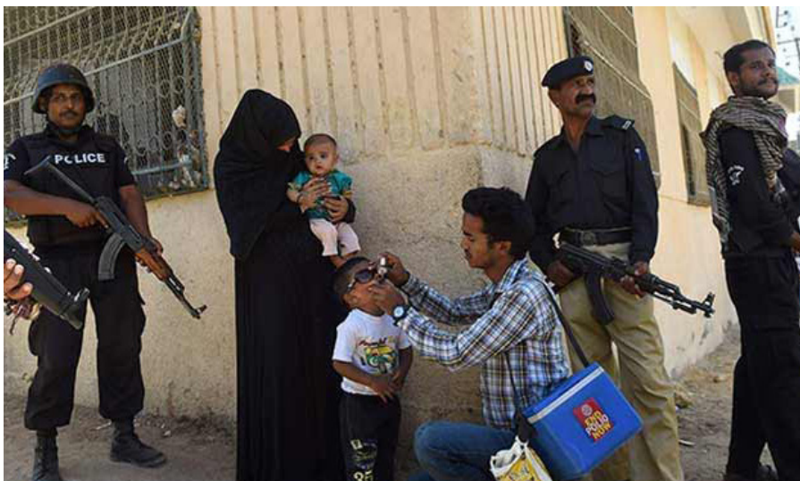
The safety of health professionals conducting polio campaigns remained a critical concern.

The safety of health professionals conducting polio campaigns remained a critical concern. On 28 August, unidentified attackers fatally shot a polio vaccination campaign supervisor in Quetta, highlighting the ongoing security threats faced by polio workers. The attack disrupted the vaccination process and raised renewed concerns about the safety of health personnel.