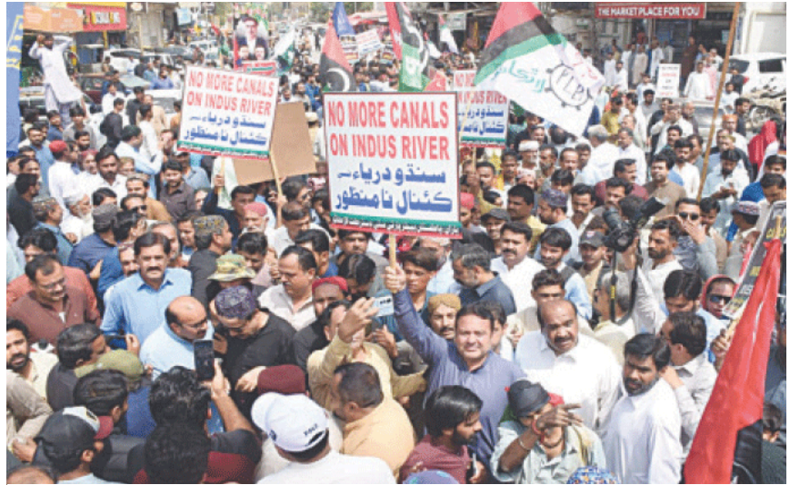
Political activists, lawyers, journalists, students, and farmers organised province-wide protests over the proposed construction of six canals on the Indus River system.

During much of 2025, Sindh witnessed sustained public unrest over the proposed construction of six canals on the Indus River system, amid widespread concerns about worsening water shortages during critical agricultural seasons. Political activists, lawyers, journalists, students, and farmers organised province-wide protests. The Sindh Assembly passed a resolution opposing the project, arguing that it had been initiated without approval from the Council of Common Interests (CCI). Subsequently, the federal government referred the matter to the CCI, which suspended the canal project pending inter-provincial consensus.