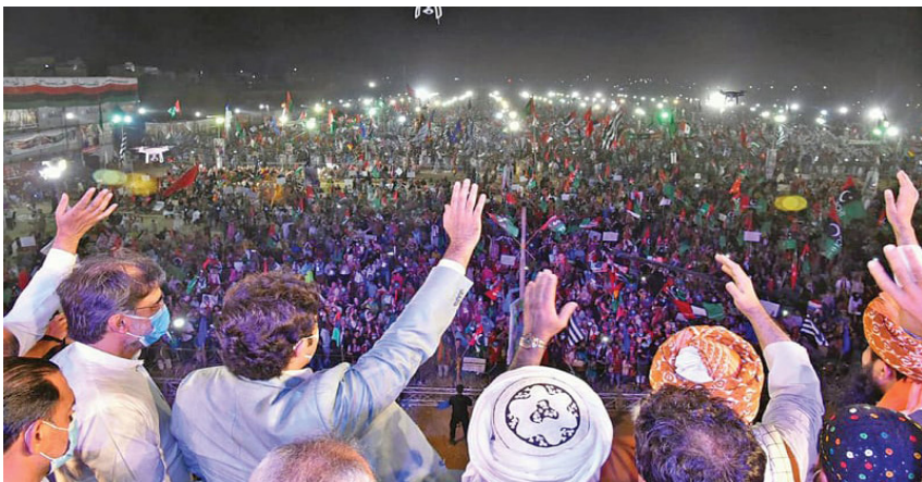
The PDM rallies kicked off in Punjab, the power base of the main opposition party

The opposition parties chose not to pursue their resistance to the shrinking democratic space in the assemblies and formed a political alliance to agitate in the streets. The PDM rallies kicked off in Punjab, the power base of the main opposition party – the Pakistan Muslim League (Nawaz), which harbours a growing resentment over the ostensible accountability-driven hounding of its party leaders. The threat of wholesale resignations from the assembly by the 11-party opposition alliance still loomed at the end of the year as a final resort.