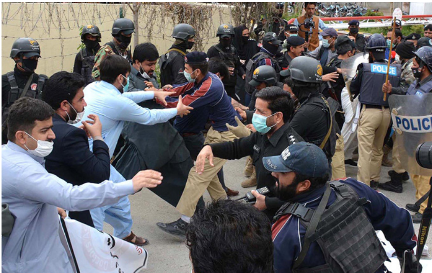
The BAP government attracted significant criticism for its mishandling of protesting doctors.

The Balochistan Awami Party (BAP), the single largest party in the provincial assembly with 24 seats, has ruled the province since August 2018. The treasury benches along with their allies hold 40 seats, while the opposition has 24 seats. The JUI-F is the second largest party, with ten seats. Although the BAP government stayed clear of political upheavals in 2020, certain major events attracted significant criticism, including its handling of the Covid-19 crisis and mishandling of protesting doctors and students in February and April.