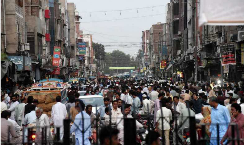
Images abound of people thronging markets with scant regard for SOPs.

The Faisalabad administration and police—themselves in violation of human rights instruments—chose to resort to stun batons against violators of the SOPs, and cases were reported of police forcing people to assume humiliating positions as punishment. The later ‘smart lockdowns’, preferred to the imposition of wider measures, were only loosely managed.