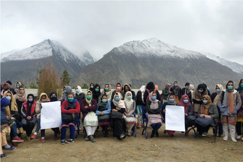
Several protests were staged by KIU students in Gilgit, Hunza and Ghizer districts against the incident.