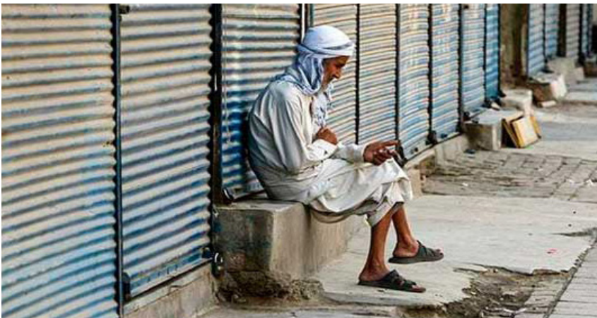
By October, as many as 856 'micro smart lockdowns' had been imposed by the Punjab government in the 36 districts of the province.

With very mixed messages being disseminated, people continued to throng the streets and marketplaces whenever restrictions were eased. In so-called 'smart' two-week lockdowns of streets, which continued to be announced at regular intervals until the end of the year, barriers manned by police were put in place, but no information appeared to be provided to neighbouring streets and police were noticeably missing after two days, calling into question the commitment to these measures. At one stage, in October, it was reported that as many as 856 'micro smart lockdowns' had been imposed by the Punjab government in the 36 districts of the province.