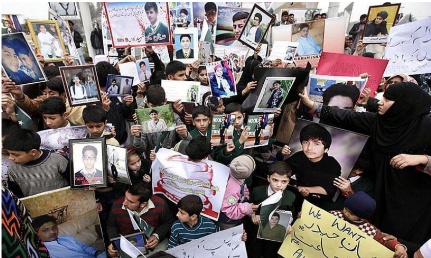
In June, a judicial commission completed its probe into the 2014 Army Public School massacre and submitted its report to the Supreme Court of Pakistan.

In another significant development in June, the PHC set aside the convictions of 196 suspected militants by military courts and ordered