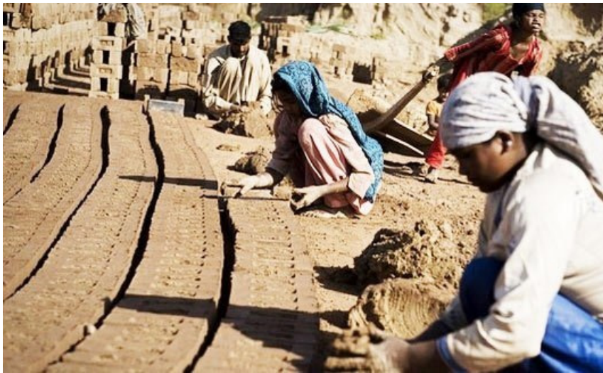
Under an amendment to the Balochistan Bonded Labour System Bill 2020, people found involved in hiring bonded labour would be liable to one year's imprisonment and a fine of PKR 100,000.

Under an amendment to the Balochistan Bonded Labour System Bill 2020, people found involved in hiring bonded labour would be liable to one year's imprisonment and a fine of PKR 100,000. Vigilance committees would also be established at the district level to monitor the situation of bonded labour. The cabinet also approved the Balochistan Employment of Children Probation and Regulation Bill 2020.