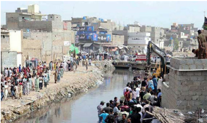
In the Gujjar nullah area, residents, fearing homelessness, took to the streets a day after authorities launched an anti-encroachment drive in September.

The KMC was supposed to demolish 850 illegal houses in a major anti-encroachment operation to clear the area on the other side of the Mehmoodabad stormwater drain. A heavy contingent of police and other law enforcement officials was called in because violence was expected.