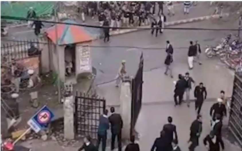
A violent clash between lawyers and the police left around two dozen injured on both sides in Muzaffarabad.

On 15 February, a violent clash between lawyers and the police left around two dozen injured on both sides in Muzaffarabad. A lawyer later alleged that the police were trying to arrest one of his clients who had entered the court to obtain bail before arrest.