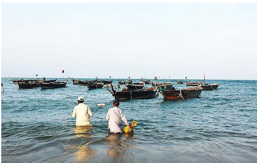
In January, high tides and winds badly affected the vessels and other fishing equipment of fisherfolk in Gwadar.

While fishing is a major source of livelihood for almost 70 percent of people living in the coastal areas of Balochistan, the climate crisis and massive infrastructural development in the shape of CPEC projects have jeopardised the community's means of living. In January, high tides and winds badly affected the vessels and other fishing equipment of fisherfolk in Gwadar. However, the government later compensated them for the losses they had incurred.