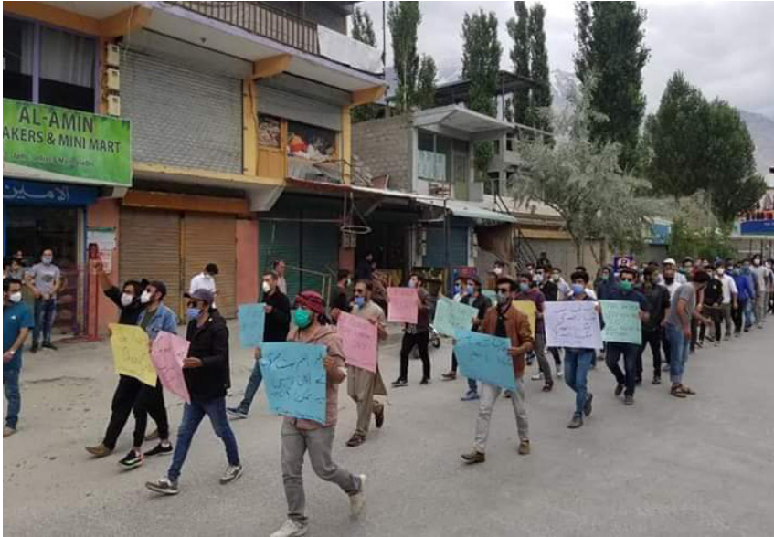
Numerous demonstrations were held by students in different districts, demanding that the government improve the state of internet connectivity.

Subsequently, a widespread national social media campaign was launched demanding that GB residents be accorded greater digital rights. The #Internet4GilgitBaltistan movement became a top Twitter trends in less than 24 hours of the campaign launch and helped create awareness of digital rights.