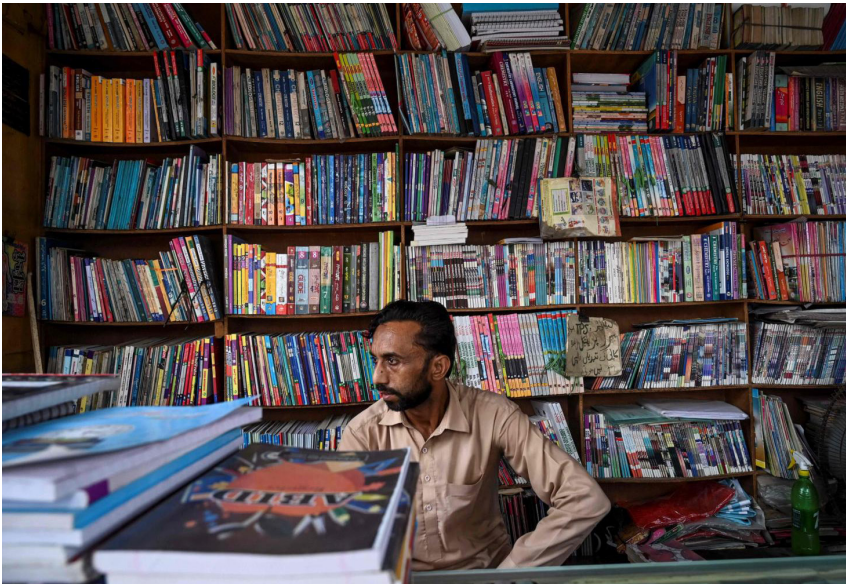
An amendment to the Punjab Curriculum and Textbook Board Act 2015 led to the banning of about 100 textbooks taught at private schools.

Another important but controversial law was the Punjab Tahaffuz-i-Bunyad-i-Islam Bill 2020, passed in July, that gave the Punjab government's director general of public relations sweeping powers to inspect printing presses, bookstores and publishing houses, vetting and confiscating all publications deemed to contain objectionable content.