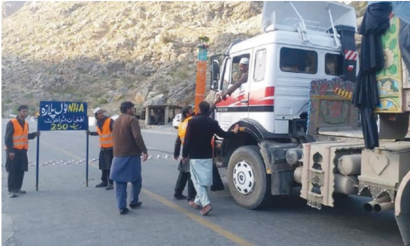
Transporters in Khyber protested against a new check-post alleging that its personnel were extorting Afghanistan-bound vehicles in Bara for money.

In June, the residents of Kurd Sharif—a locality in Karak—protested against a week-long siege by the Punjab Police, which had closed the area's only land route to Punjab to force locals to hand over an alleged criminal. Residents said they were facing shortages of food and other essential items as a result. In June, transporters in Khyber protested against a new check-post and alleged that its personnel were extorting Afghanistan-bound vehicles in Bara for money.