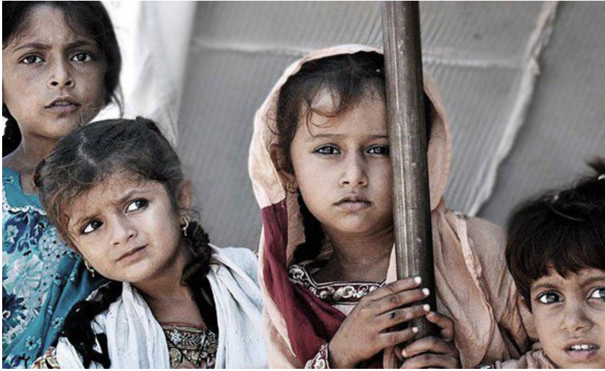
Crimes against children, including rape and murder, were rampant in KP in 2020.

At least nine cases of child rape were reported in the press in KP during the year. These included seven girls aged between two-and-a-half and 14 years old in separate incidents in Hangu, Buner, Peshawar, Nowshera, Mansehra and Abbottabad districts.