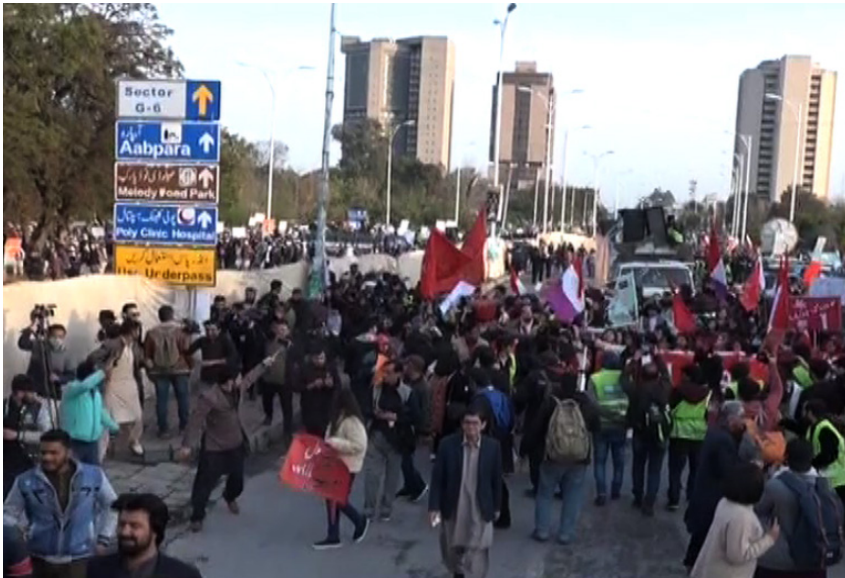
Participants at the Aurat Azadi March were pelted with stones allegedly by far-right groups during a rally on International Women’s Day.

After participants at the Aurat Azadi March were pelted with stones allegedly by far-right groups during a rally on International Women’s Day, the organisers demanded a judicial inquiry into the incident. Even though they had applied for a no-objection certificate for the event weeks in advance, it was delayed until the last day, reportedly because of pressure from right-wing groups.