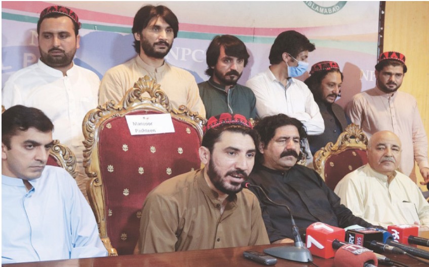
The KP government withdrew the terrorism cases registered against Manzoor Pashteen, Ali Wazir and Mohsin Dawar.

at the Kharqamar military check-post. A first investigation report was registered by the Counter-Terrorism Department against PTM leaders and workers for allegedly attacking the military check-post in May 2019, in which 13 persons were killed and multiple others injured.