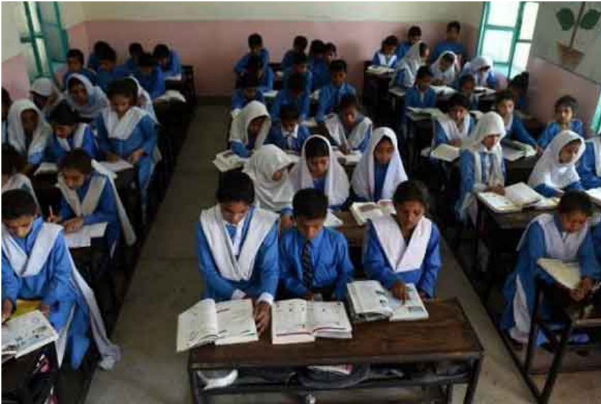
About 45 percent of Pakistani children studying in the fifth standard in rural areas could not read English sentences meant for students of Class 2.

The report further said that only 60 percent of students in the fifth standard could tell the time correctly and solve addition word problems. Only 53 percent could solve multiplication word problems.