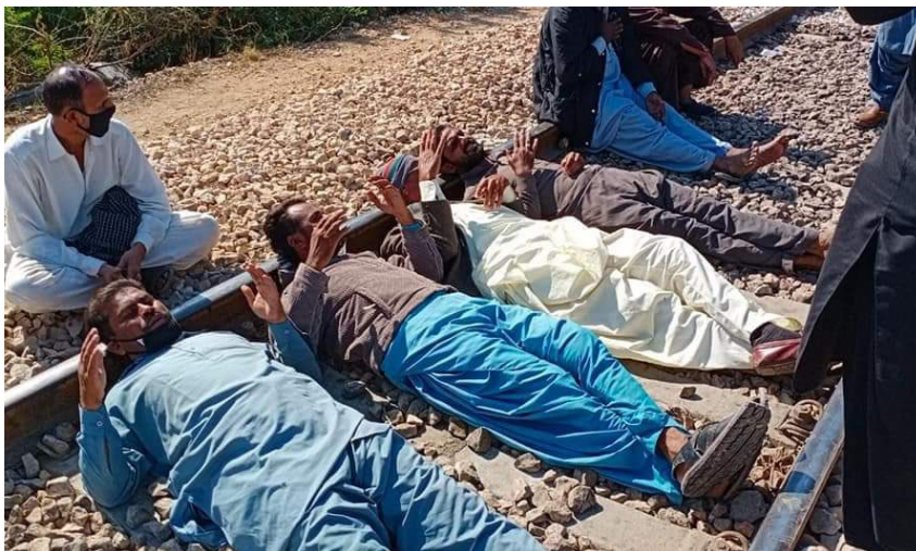
A large number of PSM workers held protests and closed down the main railway track in December.

However, workers' bodies and human rights organisations widely condemned the move, as did the Sindh government. A large number of PSM workers held protests and closed down the main railway track in December. After being persuaded by the provincial ministers, the workers called off their sit-in.