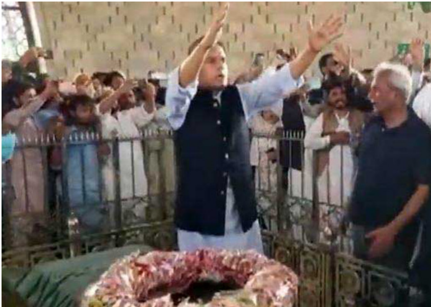
A case was registered against Captain (Retd) Safdar Awan for violating the sanctity of the Mazar-e-Quaid, damaging government property and raising slogans.

Later, a press release issued by Inter-Services Public Relations (ISPR), the army's media wing, said that the chief of army staff had asked the Karachi corps commander to 'immediately inquire into the circumstances to determine the facts and report back as soon as possible.' A joint statement issued by civil society organisations, including HRCP, expressed serious concern over 'undue pressure' imposed on the IGP.