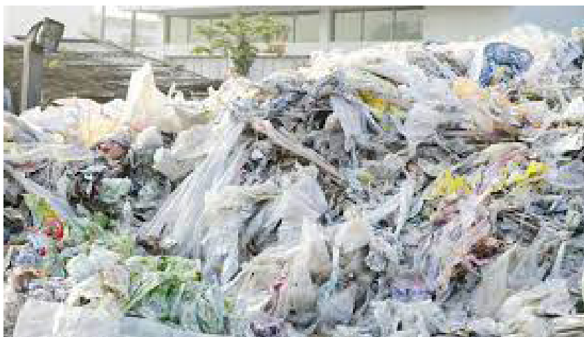
Enforcement on ban of plastics appears more effective in malls, hotels and markets in main cities.

The government appears to have adopted a scattergun approach in the ban on plastic bags in the province. Enforcement appears more effective in malls, hotels and markets in main cities – areas that are more easily monitored. Outside those areas, however, the message may not have filtered through. As in the observance of Covid-19 SOPs and closure of shops, the follow-through necessary in the wake of the introduction of restrictions is lacking, perhaps because of the lack of human resources or incentives to look the other way.