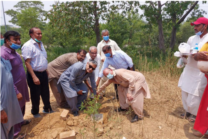
Far right groups protested against the proposed construction of a Hindu temple in Islamabad.

In July, the construction of a Hindu temple in Islamabad became controversial after Prime Minister Imran Khan approved a grant of PKR 100 million for its construction in June. Far right groups protested against the proposed construction. HRCP welcomed the approval of the grant and condemned any protests against the temple. The IHC dismissed pleas against the temple's construction.