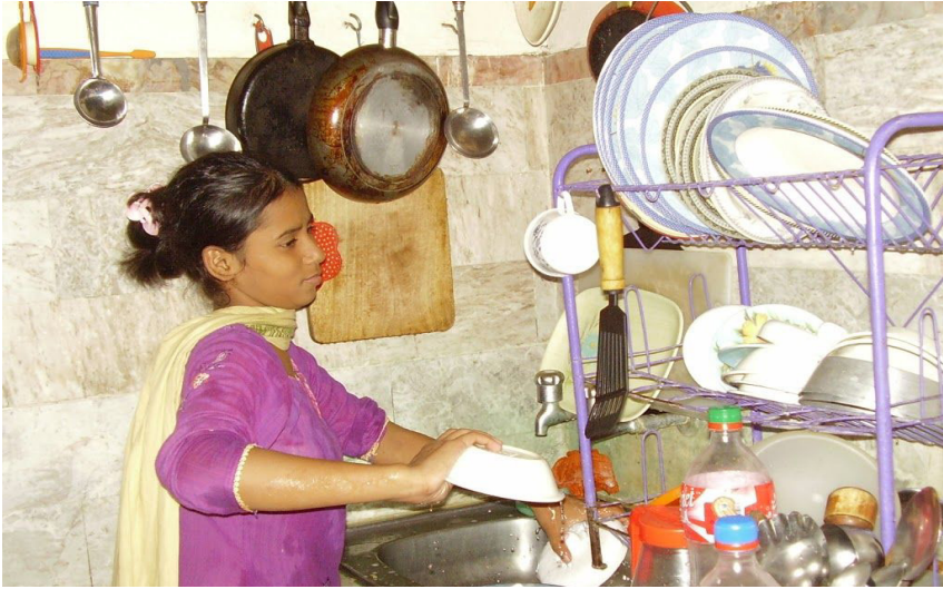
Child domestic labour has been declared a hazardous line of work and is criminalised.

Interior criticised by a parliamentary committee in July for not notifying the criminalisation of child domestic labour. The notification was finally issued in August but, like the Zainab Alert, Response and Recovery Act 2019, is only initially applicable to the Islamabad Capital Territory.