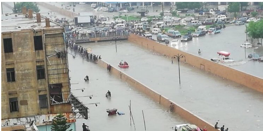
Sindh witnessed a near-breakdown of civic amenities during the 2020 monsoon rains.

When Sindh witnessed a near-breakdown of civic amenities during the 2020 monsoon rains, with widespread urban damage caused by choked drainage systems, the province's fractured local governance was a key factor involved. Local governments failed to provide any relief to people, many of whom suffered heavy financial and material losses. In Karachi, a number of residential areas, including the posh Defence Housing Authority, suffered heavy floods.