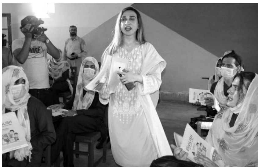
The South Punjab Education Department opened schools for the transgender community in Bahawalpur, Dera Ghazi Khan and Lahore.

Schools for transgender community. On a positive note, the South Punjab Education Department opened a school for the transgender community in Bahawalpur on 12 March and in Dera Ghazi Khan on 1 August. The aim was to educate transgender students to allow them to earn a decent livelihood. The first transgender school was inaugurated in Lahore on 8 December. 34