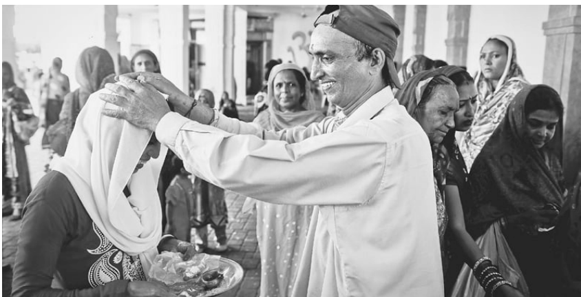
The Rakhi festival was celebrated at Gurdwara Panja Sahib in Hasanabdal after a gap of two years.

The government of Punjab also assigned the Walled City of Lahore Authority to conserve churches, temples and shrines in Lahore. Work on the restoration of the Jain Mandir was initiated.