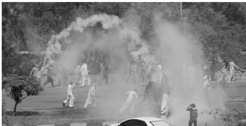
Clashes occurred between PTI protestors and law enforcement personnel as police fired tear gas.

roadblocks on highways leading to Islamabad.irate protesters pelted stones and threw tear gas shells back at the police before scores of them were taken into custody. 19