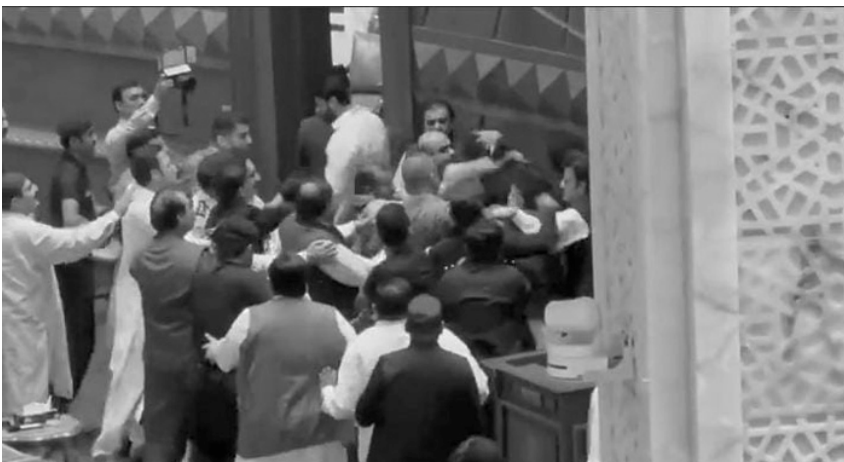
Violence broke out inside the Punjab Assembly during the election for the post of chief minister on 16 April.

The Punjab Assembly was in a state of unrest as violence broke out inside the assembly during the election for the post of chief minister on 16 April. The Human Rights Commission of Pakistan (HRCP) expressed outrage at this outbreak of violence, tweeting that ‘it was an affront to democracy, decency and the decorum that voters expect from the people