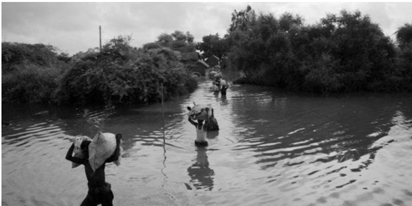
The people of Rajanpur claimed that the government had failed to repair broken banks and dykes.

The people of Rajanpur in particular felt they had been left in the lurch. They claimed that the government had failed to repair broken banks and dykes to prevent water from reaching their residential areas. By September, most people in the district had begun returning home on foot, saying they could not continue living in tents and camps because the government was 'not facilitating them.' 64